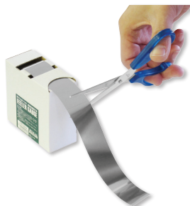
Can be cut to necessary size