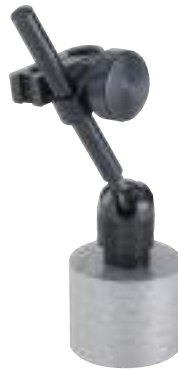
7014-10 (magnetic clamping is non-switchable)