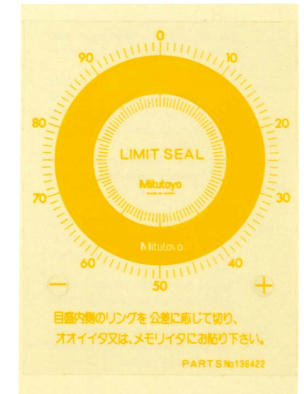
136422 (10 sheets/set)

The limit hand and bezel clamp are now available as options.