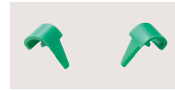
Limit hand (2 pcs.)