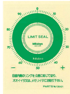
136421 (10 sheets/set)