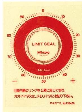
136420 (10 sheets/set)