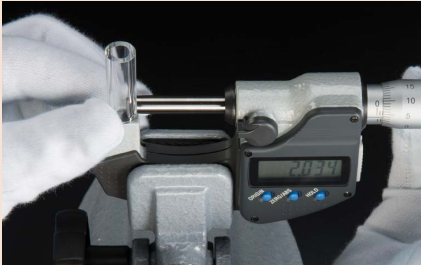
Type A (pin)