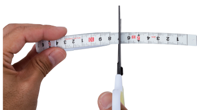
Can be cut